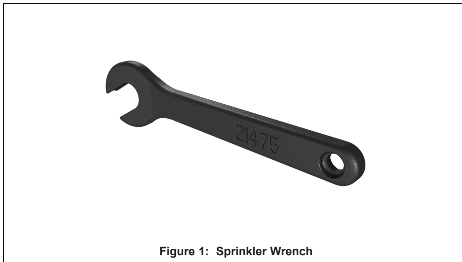
Figure 1: Sprinkler Wrench

5 For automatic sprinklers, the coatings indicated are applied to the exposed exterior surfaces only. Note that the spring is exposed on sprinklers with Polyester coatings.