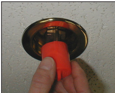
Figure 2: Sprinkler cap being removed from a pendent sprinkler.