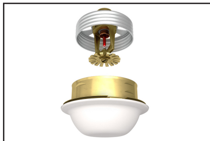
Cover Plate Assembly (Pendent Cover 12381 shown)