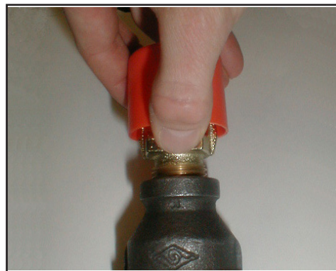
Figure 3: Sprinkler cap being removed from an upright sprinkler.