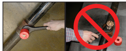
CORRECT (Piping is in place at the ceiling)