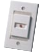
RA400Z Remote Annunciator (UL S2522)