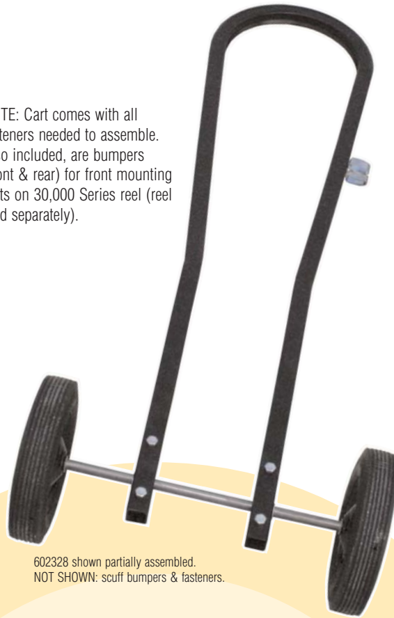
602328 shown partially assembled. NOT SHOWN: scuff bumpers & fasteners.

NOTE: Cart comes with all fasteners needed to assemble. Also included, are bumpers (front & rear) for front mounting slots on 30,000 Series reel (reel sold separately).