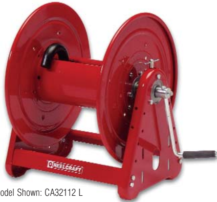
Model Shown: CA32112 L

The Series 30,000 is designed for rugged, heavy duty applications and features a large storage capacity. The 602328 Side Mount Cart was specifically designed to be compatible with 30,000 Series 6" and 12" models. The cart and reel, as a package, offer a convenient and easily maneuverable option to store and transport long lengths of hose. Other reels not listed may be compatible. Consult manufacturer for more details.