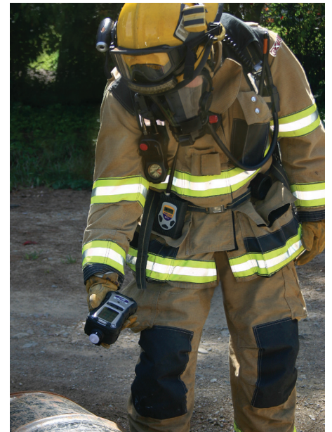
MultiRAE Pro with RAELink3 Mesh used for screening potentially hazardous drums