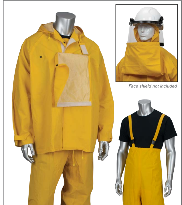
Face shield not included