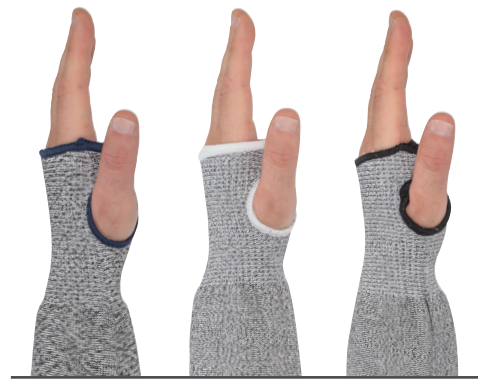
20-S10ATA/PE7-T A7 20-S10ATA/PE8-T A8 20-S10ATA/PE9-T A9