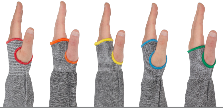
20-S13ATA/PE2-T A2 20-S13ATA/PE3-T A3 20-S13ATA/PE4-T A4 20-S13ATA/PE5-T A5 20-S13ATA/PE6-T A6