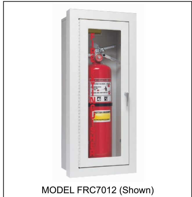
MODEL FRC7012 (Shown)

Model 7070-7088: Brass - Polished finish, clear polyester coated