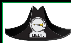
XF1 Front Plate, Lieut. w/1 trumpet (GA1150-N4)