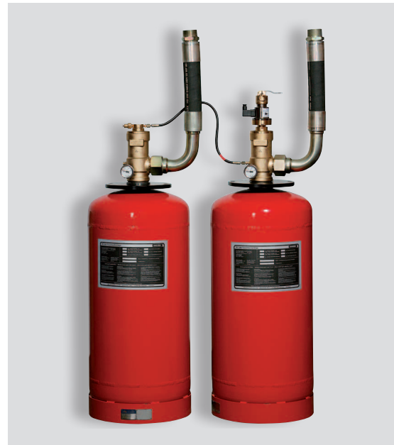
Example of a multi-cylinder system