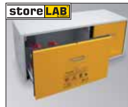
AUS Type 90 / 1400-500 SF SF, Article No. B80-2909-G