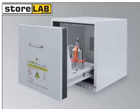
AUS Type 90 / 600 SF, Article No. B80-2801-A, with perforated socle, available as accessory