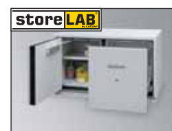
AUS Type 90 / 1100 FT SF, Article No. B80-2808-A, with additional shelf and perforated socle, available as accessory

* max. load 30 kg per shelf with uniformly distributed load