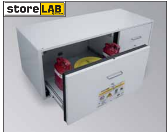
AUS Type 90 / 1400-500 SF SF, Article No. B80-2909-A