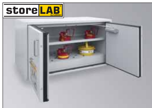
AUS Type 90 / 1100-500 FT, Article No. B80-2899-A, with additional shelf, available as accessory

* max. load 30 kg per shelf with uniformly distributed load