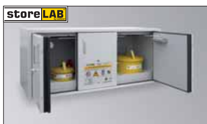
AUS Type 90 / 1400 FT, Art. No. B80-2917-A

* max. load 30 kg per shelf with uniformly distributed load