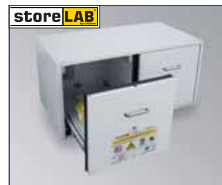
AUS Type 90 / 1100-500 SF SF, Article No. B80-2900-A