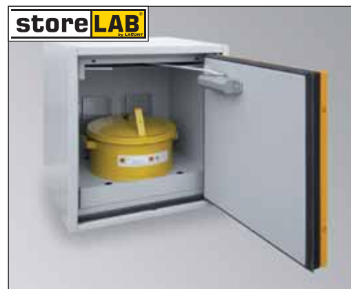
AUS Type 90 / 600-500 FT, Article No. B80-2897-G

* max. load 30 kg per shelf with uniformly distributed load