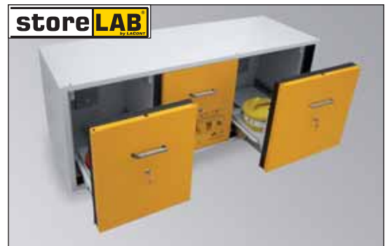
AUS Type 90 / 1400-500 SF, Article No. B80-2907-G