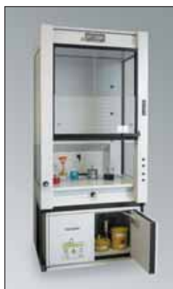
AUS Type 90 / 880 FT below a fume hood

* max. load 30 kg per shelf with uniformly distributed load