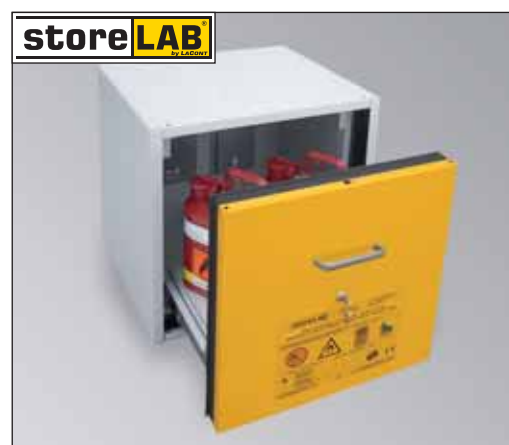
AUS Type 90 / 600-500 SF, Article No. B80-2895-G