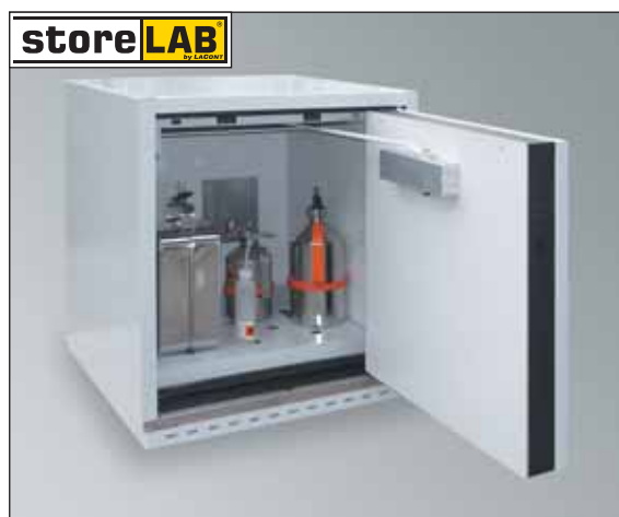
AUS Type 90 / 600 FT, Article No. B80-2800-A, with perforated socle, available as accessory