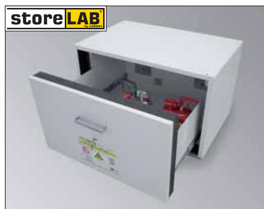
AUS Type 90 / 880 SF, Article No. B80-2865-A