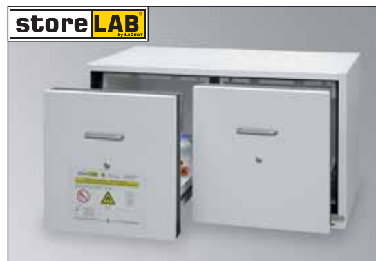
AUS Type 90 / 1100 SF SF, Article No. B80-2809-A, RAL 7035, with perforated socle, available as accessory