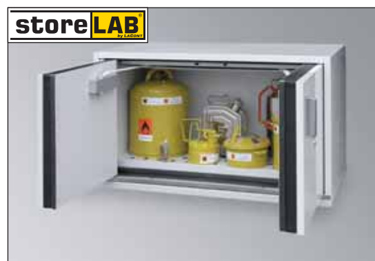
AUS Type 90 / 1100 FT, Article No. B80-2806-A, with socle, available as accessory