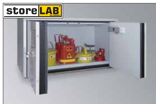
AUS Type 90 / 880 FT, Article No. B80-2864-A