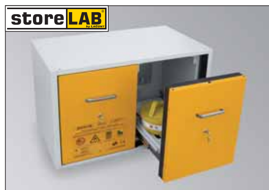
AUS Type 90 / 880 SF SF, Article No. B80-2916-G