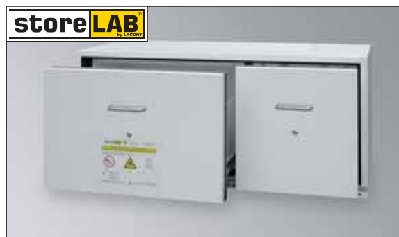
AUS Type 90 / 1400 SF SF, Article No. B80-2815-A

* max. load 30 kg per shelf with uniformly distributed load