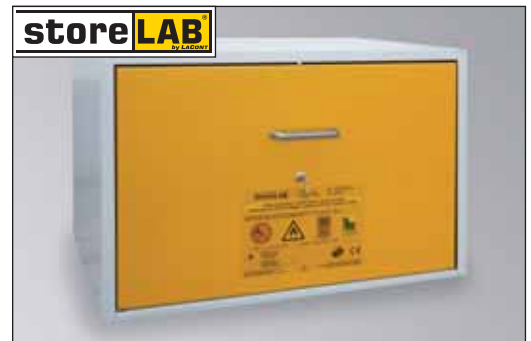
AUS Type 90 / 880-500 SF, Article No. B80-2902-G