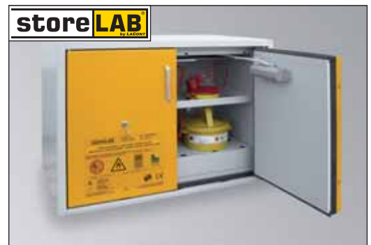
AUS Type 90 / 880-500 FT, Article No. B80-2901-G, with additional shelf, available as accessory