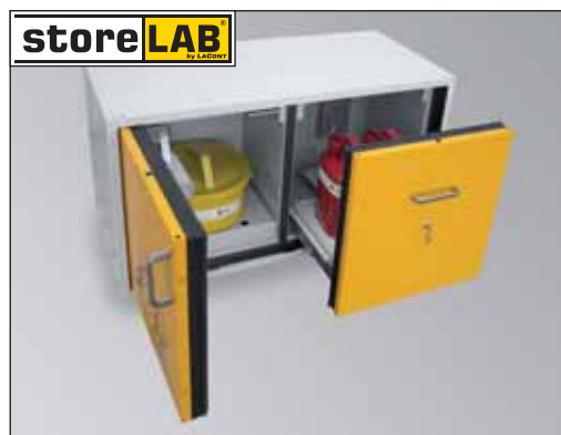
AUS Type 90 / 1100-500 FT SF, Article No. B80-2890-LG