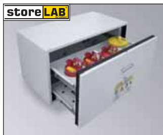
AUS Type 90 / 1100-500 SF, Article No. B80-2898-A, with additional pull-out shelf, available as accessory