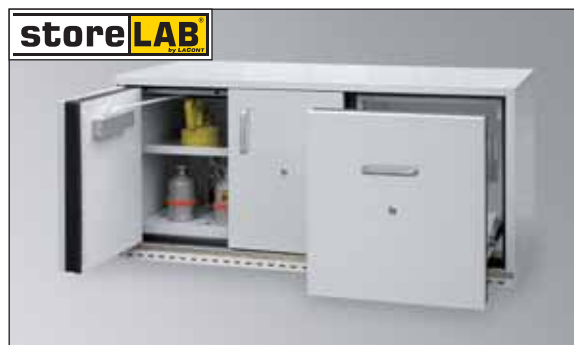
AUS Type 90 / 1400 FT SF, Article No. B80-2814-A, with additional shelf and perforated socle, available as accessory