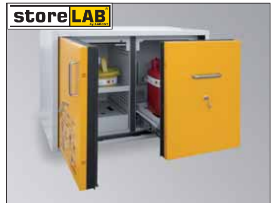
AUS Type 90 / 880-500 FT SF, Article No. B80-2903-LG, with additional shelf, available as accessory