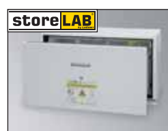
AUS Type 90 / 1100 SF, Article No. B80-2807-A, with perforated socle, available as accessory