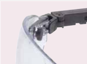
Patented lens inclination system for a customized fit.