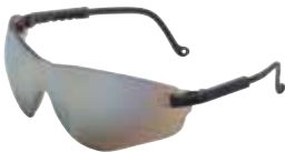
Gold Mirror — Deflects sunlight and glare