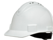
Honeywell North Short Brim Hard Hat Vented SKU: NSB11001