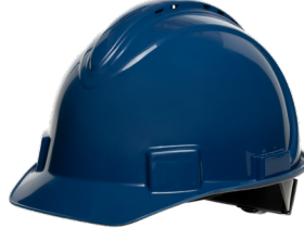
Dark Blue NSB11071