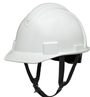
Chin Strap NSB100CS