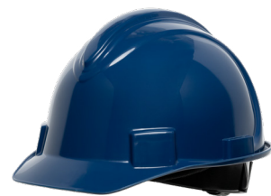
Dark Blue NSB10071