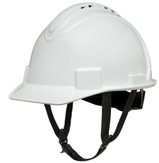
Chin Strap NSB100CS