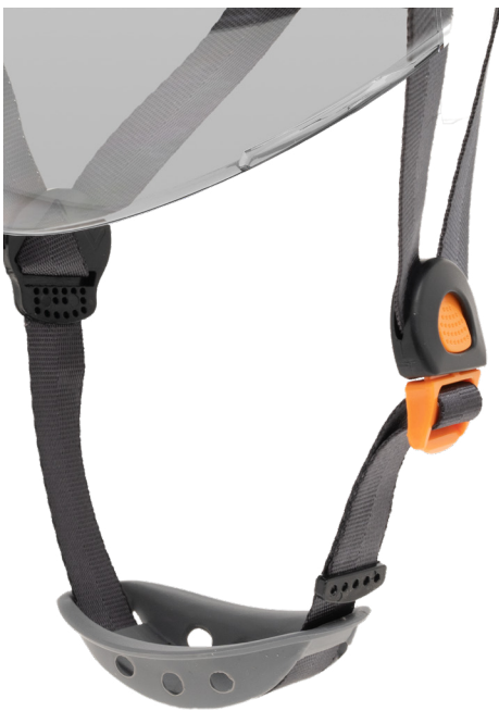
Honeywell Fibre Metal Safety Chin Strap SKU: FSH100CS