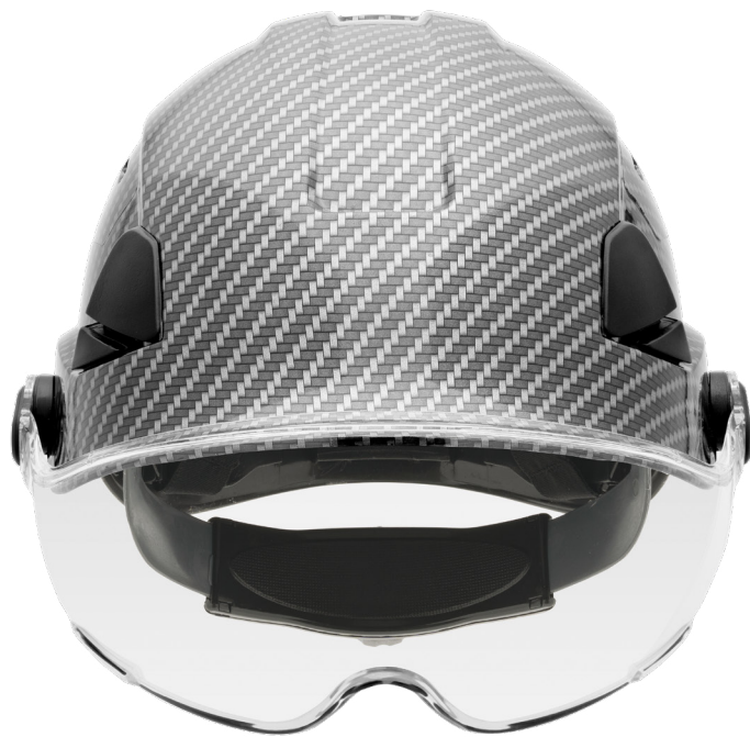
Honeywell Fibre Metal Safety Helmet Visor Replacement SKU: FSH100VS