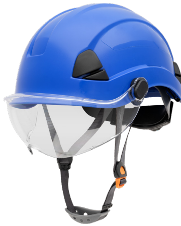
Dark Blue FSH10071