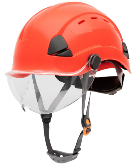
Honeywell Fibre Metal Safety Helmet SKU: FSH11015