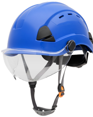
Dark Blue FSH11071