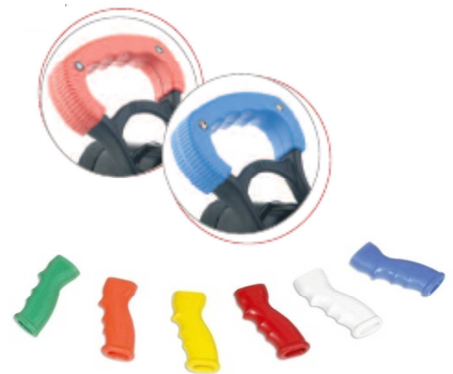
Grips available in several colours