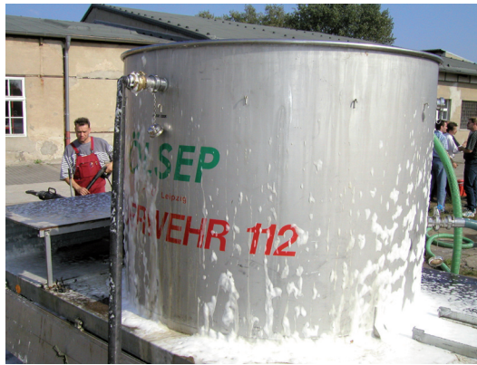
Cleaned separator (outside and inside)

The Gimaex deFcon® 200 G foam decontamination systems have proven themselves in many cases in the past and therefore they have been purchased and operated due to their quality and efficiency from different consumers like: