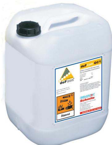
deFcon® G additive for the foam decontamination

For the operation the specific deFcon® agents for equipment or skin have to be added.