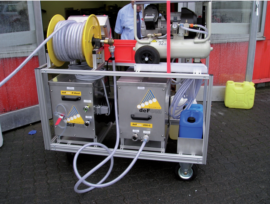
deFcon® 200-G foam decontamination system with additional module deFcon® P-Skin for the decontamination of persons

An additional module for generating a deFcon® P foam for the decontamination of persons can be integrated if required.