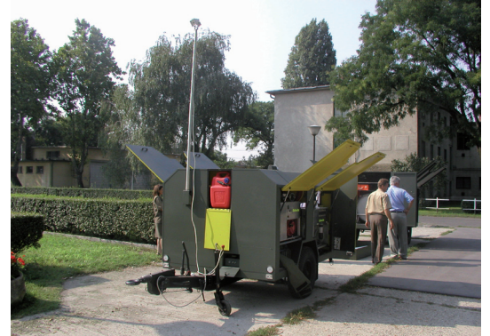
Application of the deFcon® 200 G system at the Hungarian Army in a trailer

The Gimaex foam decontamination system deFcon® 200 G can be used mobile or stationary as required. It can especially easy be integrated into: vehicles, Ro/Ro-Containers, trolleys and trailers.