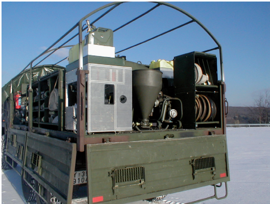
EKfz of the German Army