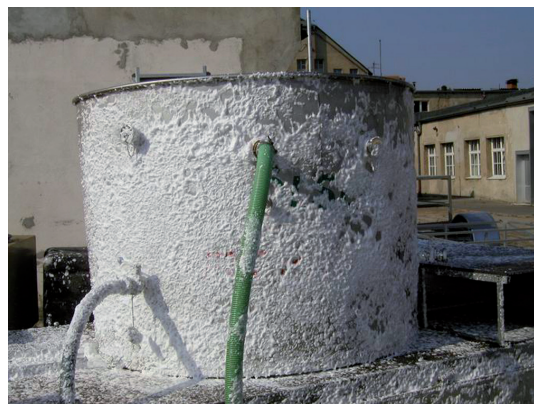
Mobile oil separator foamed with decontamination foam after the operation during the flood catastrophe