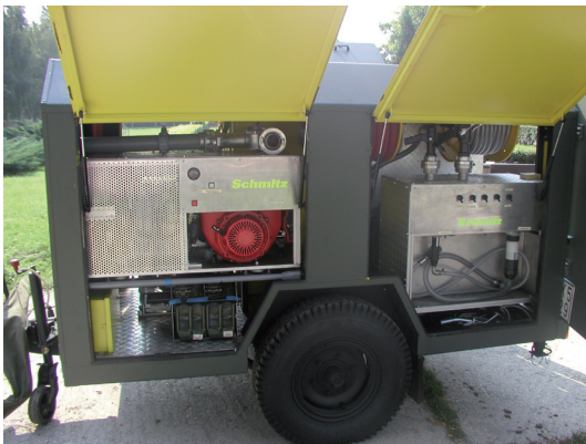
Hungarian Army - deFcon® 200 G