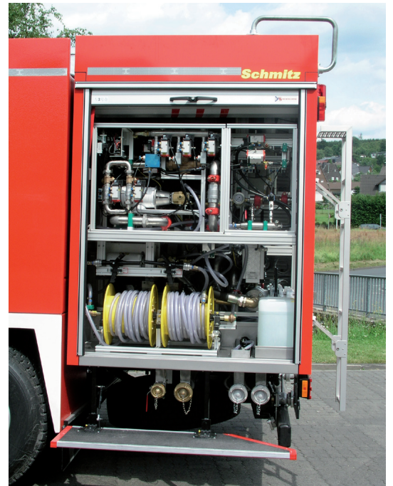
Installation of the deFcon® 200 system in a firefighting vehicle