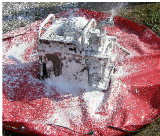
Foamed peristaltic pump

Various military consumers decided to use the deFcon® technology due to its quality and proven efficiency.