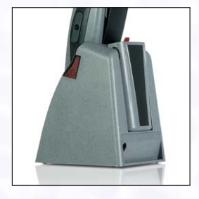
Charger with additional charging slot for second battery

www.funkwerk-sc.com info@funkwerk-sc.com