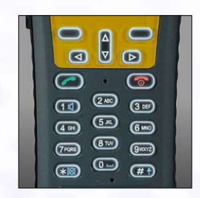
Robust, shock-resistant housing, illuminated keypad with good differentiation for use when wearing gloves