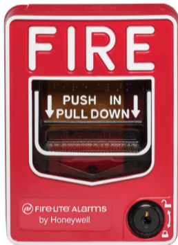
SWIFT W-BG12 Addressable Wireless Pull Station