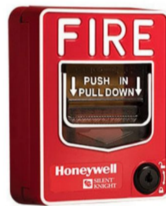
WSK-PULL Wireless Addressable Pull Station