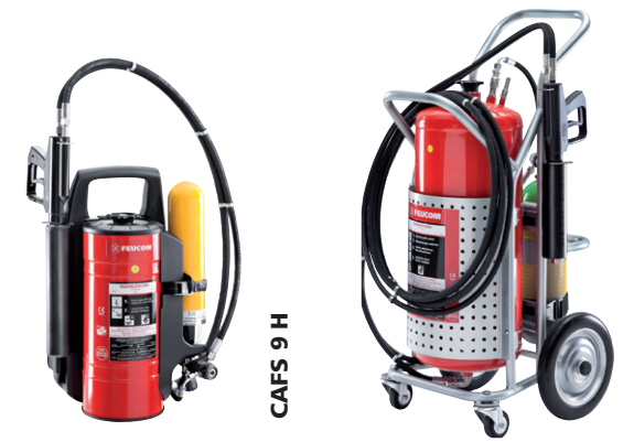
CAFS 9 H

If you need high performance extinguishers, whether for indoor or outdoor use, we recommend the FEUCOM CAFS with low operating pressure and enormous jet range. These devices are made from extremely high-quality materials, such as V4A steel. The CAFS 50/5 H can be used as an alternative to the conventional extinguishing water systems. In addition, a variety of different water and foam-based extinguishing agents can be employed. For further details see www.feucor.de .