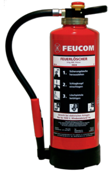
PG 6 H-KE

Selected devices of this model range have been approved by MED/SOLAS (ships wheel).