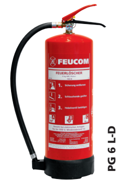
PG 6 L-D