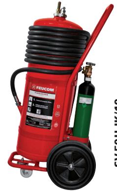
SV 50 H-IK/10