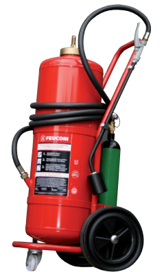
PM 30 H-1/5 MagMetall