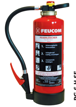
PG 6 H-SE

With the FEUCOM Standard Series you will reach your target faster! The ergonomic handle, strike-knob operation and freely turnable operating device provide you with all the advantages you need: Complete design, secure handling and fast operational readiness – all this is being offered to you at a particularly attractive price together with the quality commitment of the family Schulte-Frankenfeld.