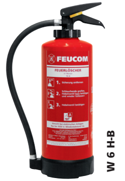
W 6 H-B