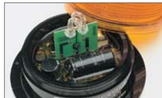
Heavy Duty Pulsator models use gel to protect complainants against vibration