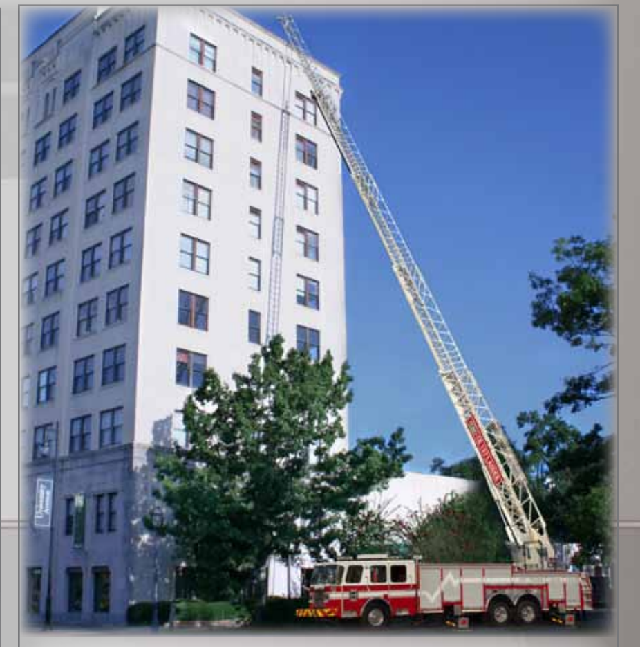
With its industry-leading reach, the CR 137 provides quick access to structures up to 13 stories or buildings with large setbacks. (The structure above is approximately 128' from ground level to the roof.)