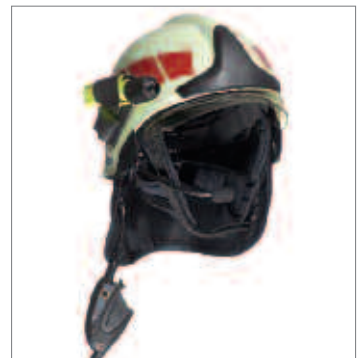
Dräger HPS 6200 With 'Romanic' front plate, clear visor, reflective stripes und communication system