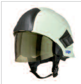
Dräger HPS 6200 With standard front plate and gold visor.