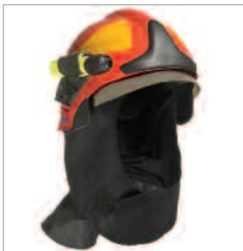
Dräger HPS 6200 With 'Romanic' front plate, clear visor and design reflective strips. Neck curtain: Scarf version