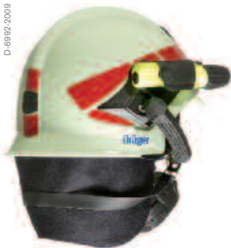
Dräger HPS 6200 with S-Fix-adapter