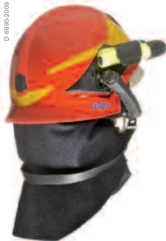
Dräger HPS 6200 with Q-Fix-adapter