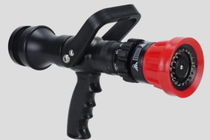
Smooth-Bore Nozzle with Jet/Spray Attachment