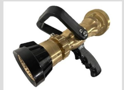
Marine Attack 500 Nozzle