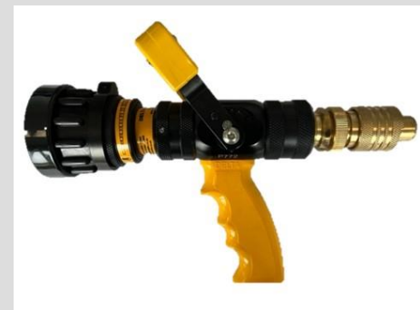
H500 ST Nozzle