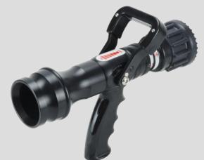
H500 Mid-Range Nozzle