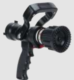
H500 Trigger-Lock Nozzle