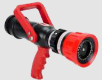
Attack 750 Nozzle