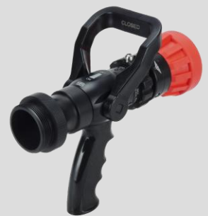
Attack 500-Pro Series Nozzle