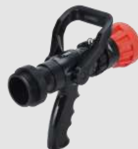
Attack 500-Pro Series Nozzle