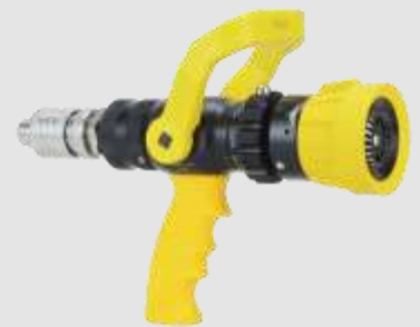
Attack 100-Pro Series Nozzle