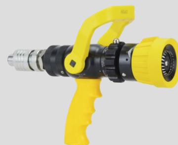
Attack 100-Pro Series Nozzle