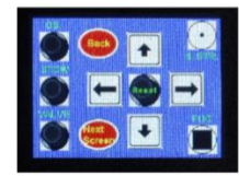
Functional Pad Display