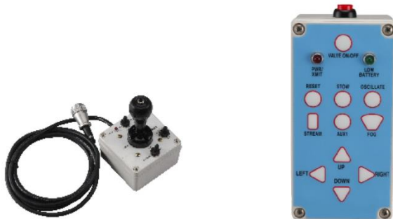
Joystick Control Wire or Wireless