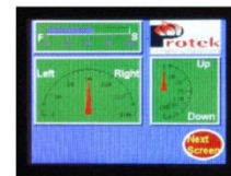
Monitor Position Display