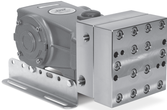
Model 781 Shown (Mounting rails sold separately)