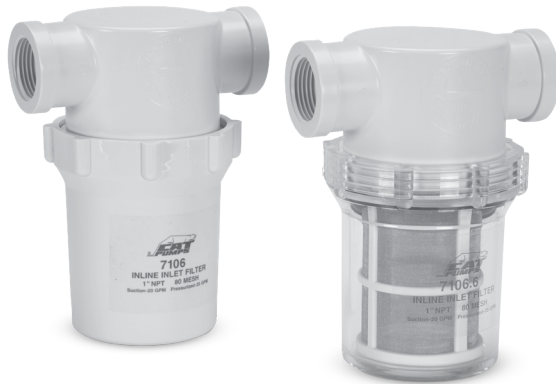
Model 7106 and 7106.6 Shown