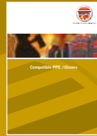
Compatible PPE Gloves