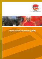
Urban Search and Rescue (USAR)