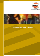
Compatible PPE Boots