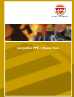
Compatible PPE Rescue Tools