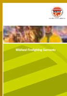
Wildland Firefighting Garments