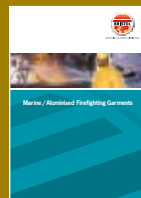
Marine / Aluminium Firefighting Garments