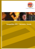
Compatible PPE Hoods and Helmets

T: +44 117 956 3101 F: +44 117 956 5927 E: enquiries@bristoluniforms.com W: www.bristoluniforms.com