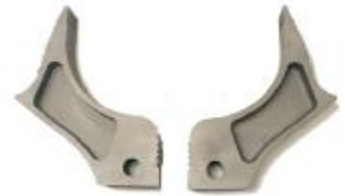
Optional Accessory: Extended Reach Tip Part No. 391000001010 Order (2) for a pair (Increase the spread up to 8 in.)